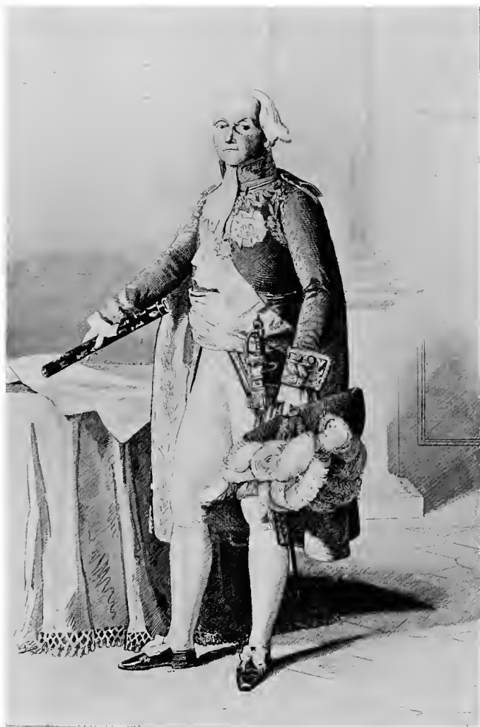
FRANÇOIS CRISTOPHE KELLERMANN, DUKE OF VALMY FROM AN ENGRAVING AFTER THE PAINTING BY ANSIAUX